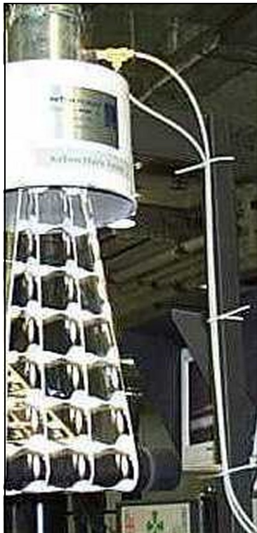
Installed Model 2000 Silicone Mister System