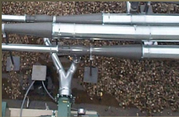
Roof mounted Energy Saving Venturis

Reduce your energy costs up to 30% with the field-proven, patented* Energy Savings Venturi. It has revolutionized the approach to pneumatic conveying systems where a continuous stream of material is desired.