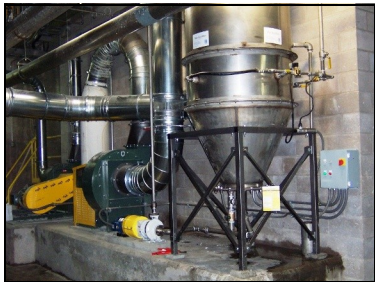
Wet Scrubber System