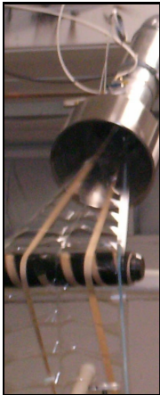
Label Matrix Twister™ Removal System