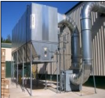
Dust Removal System