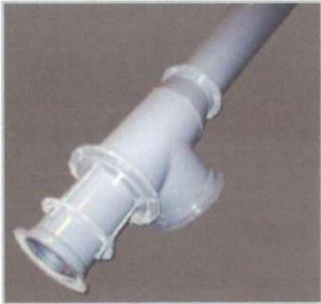
Standard AirTrim Adjustable Venturi in 3" to 8" diameters with air flow adjustment commonly used in Paper, Film, Foil & Plastic