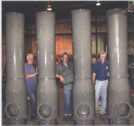
The Jumbo Venturi in 10" to 18" diameters typically designed for specialty applications most common to the Recycling Industry