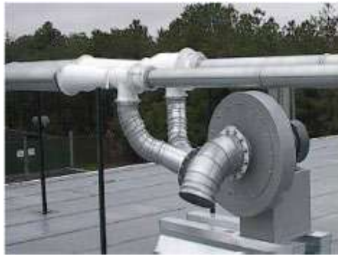
Dual adjustable inducer